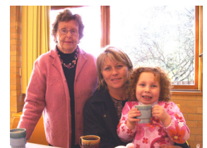
Enjoying Morning Tea

Learning for Life is a local craft group that meet at SKCC every Thursday from 9.30am - 12.00pm during the school term. Crafts the group participate in include Needlework/Embroidery, Card Making, Jewellery Making, Parchment Craft and Wood Burning. In May the Learning for Life group held a special morning tea as part of the Australia's Biggest Morning Tea fundraiser for Cancer Research. The group had a fun morning as well as raising $450.00 for cancer research. New members are always welcome in the Learning for Life group, so if you are interested in joining a friendly craft group please drop in on a Thursday morning to meet them.